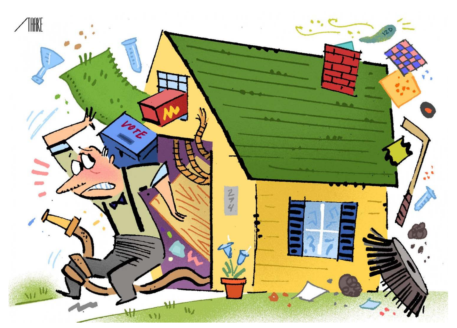
See if you can come up with uses more useful than the above for various surplus items. (Bob Staake for The Washington Post)